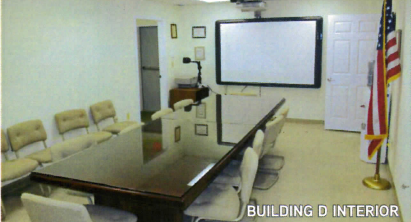
BUILDING D INTERIOR