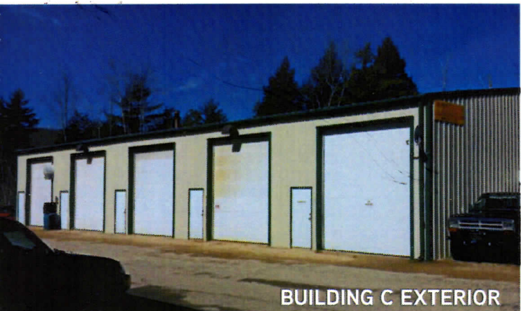
BUILDING C EXTERIOR