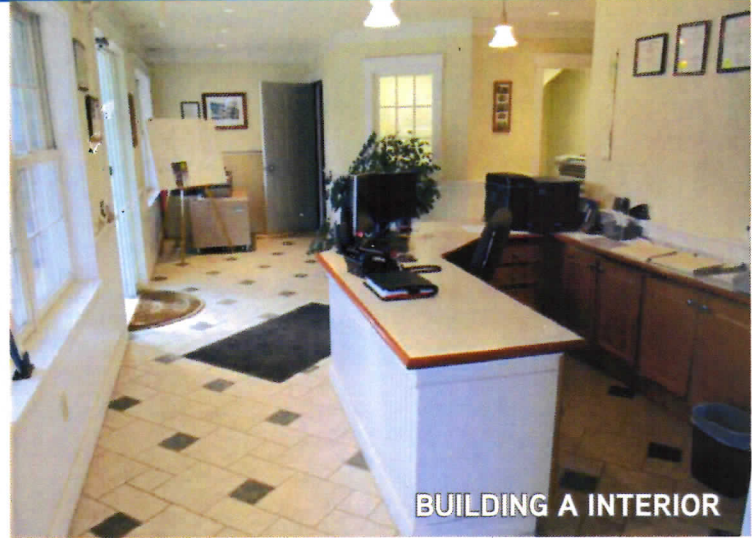
BUILDING A INTERIOR