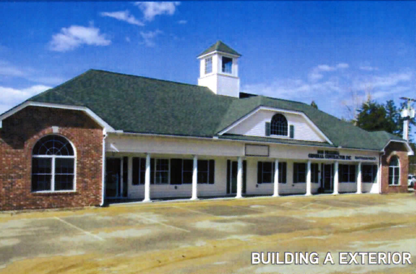
BUILDING A EXTERIOR